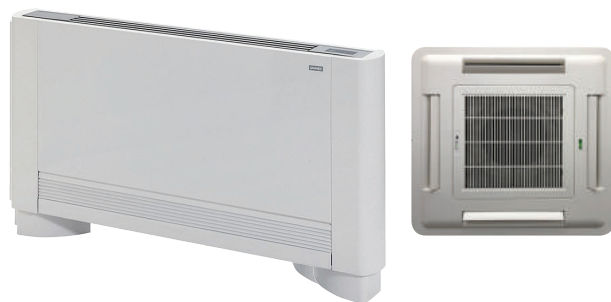
Wall and ceiling heating and cooling units