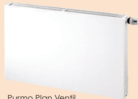
Purmo Plan Ventil