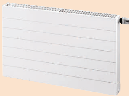
Purmo Ramo Ventil