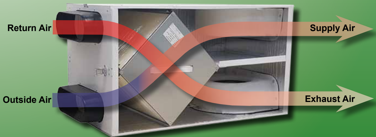
HEX390 Heat Exchange unit